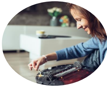
Cordless vacuum cleaners